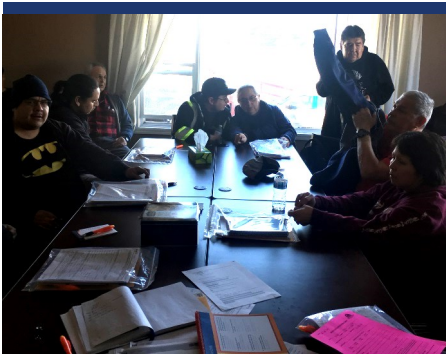
Orange Decal Workshop held for the Central Coast Commercial Fisheries Association in February.