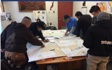
Mapping and chartwork exercise during the Small Vessel Operator Proficiency (SVOP) course held for Cowichan Tribes in February.

Other program and course offerings included Fish Safe's Stability Education course, Small Vessel Operators Proficiency (SVOP), Marine Emergency Duties A3 (MED-A3), and Restricted Operators Certificate-Maritime (ROC-M) courses. From January to June, these courses were delivered in Haida Gwaii, Bella Bella, Sechelt, Duncan, Campbell River, Port Hardy, Zeballos, Ucluelet, Alert Bay, and Harrison Mills.