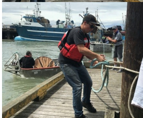
Beachline Safety Workshop participants practicing their knots. Practice, practice, practice!

At the end of June, we held our annual Beachline Safety Workshop at the Gulf of Georgia Net Loft in Steveston. The workshop was a huge success with 12 participants in attendance, some coming all the way from the Vancouver Island to partake in the hands-on training.